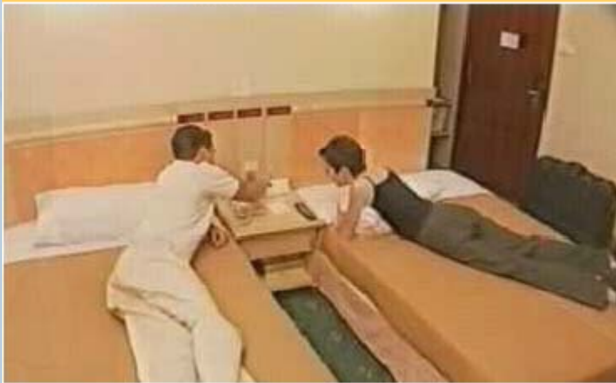
Stamford Twin Room