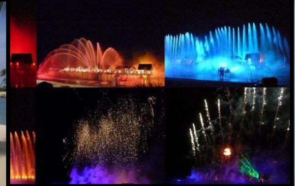
"Song of the Sea" show